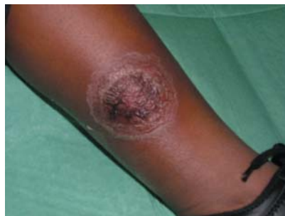
Figure 1 Area of shallow ulceration on medial aspect of left leg.