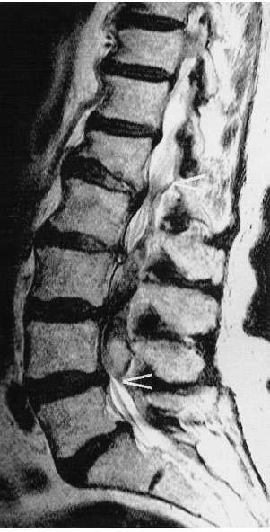
Fig. 1. Magnetic resonance imaging views, with arrows indicating margins of epidural hematoma on the day of admission to the hospital ( left ) and after expansion of hematoma ( right ).

the L3-L4 interspace. No paresthesias or blood were encounter during needle placement. Methylprednisolone, 80 mg, was injected into the epidural space. The patient experienced no exacerbations of her sciatica and was discharged from the clinic with no acute distress.