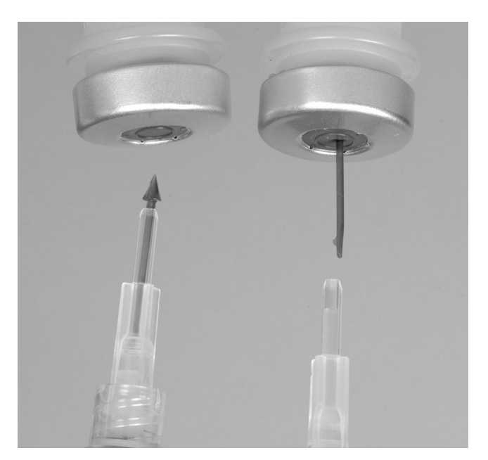
Fig. 1. Normal appearance of needleless Interlink Vial Access Cannula and the blue dart before and after aspiration of drug from the vial.